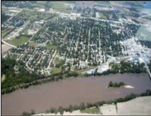
Aerial View of Wamego