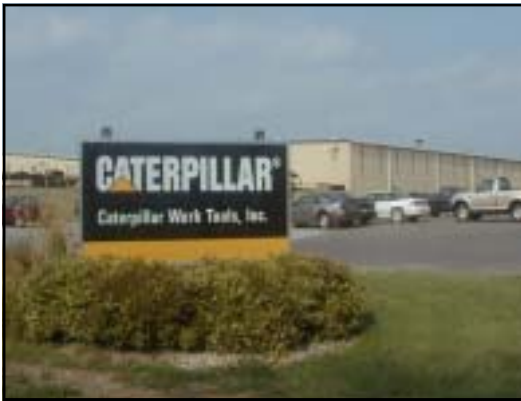
Caterpillar Work Tools, Inc. Wamego, Kansas

As a good corporate citizen, the management and staff of Caterpillar Work Tools, Inc. led the way locally in donations of items for our community benefit auction, held in September of 2001. But the generosity does not stop there.