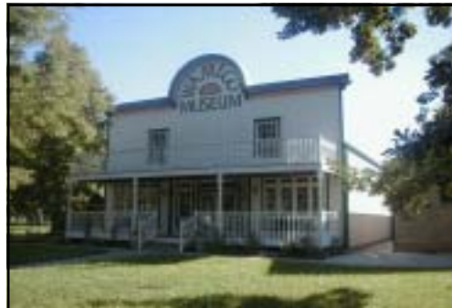
Wamego Historical Society Museum Complex

The ability of this community to rise to the occasion and turn a dream into a reality seems to be endless. This commitment by our citizens to a cause serves as a model to all communities in Kansas.