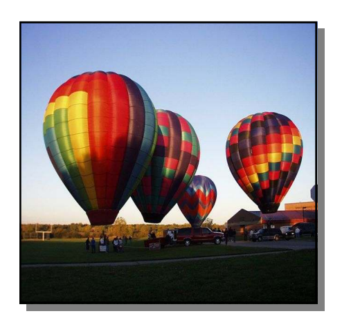
Balloon Launch at OZtober Fest

Students are required to apply for scholarship funds. Students should contact their school counselor's office for details. Once the applications have been received by each school's scholarship application deadline, they are turned over to the WCF Scholarship Committee for final review and the determination of each scholarship winner. An annual Awards Luncheon is held to recognize each winner along with their parents.